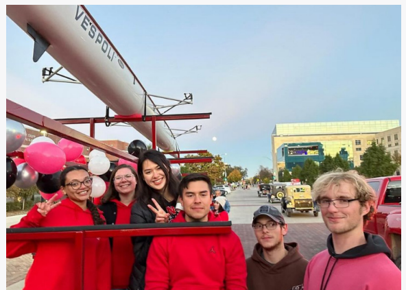
Crew having a blast at the Homecoming Parade, Shiny Red Shell Trailer Repainted by Duncan Aviation, a donation coordinated by FONR.