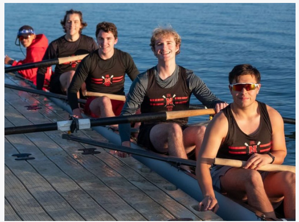
Nebraska Mens 4+ "On the Docks"

Interested in making a difference? Contact Mark Stormberg today or fill out our easy online volunteer form to learn more about available opportunities and find the perfect fit for your skills and interests.