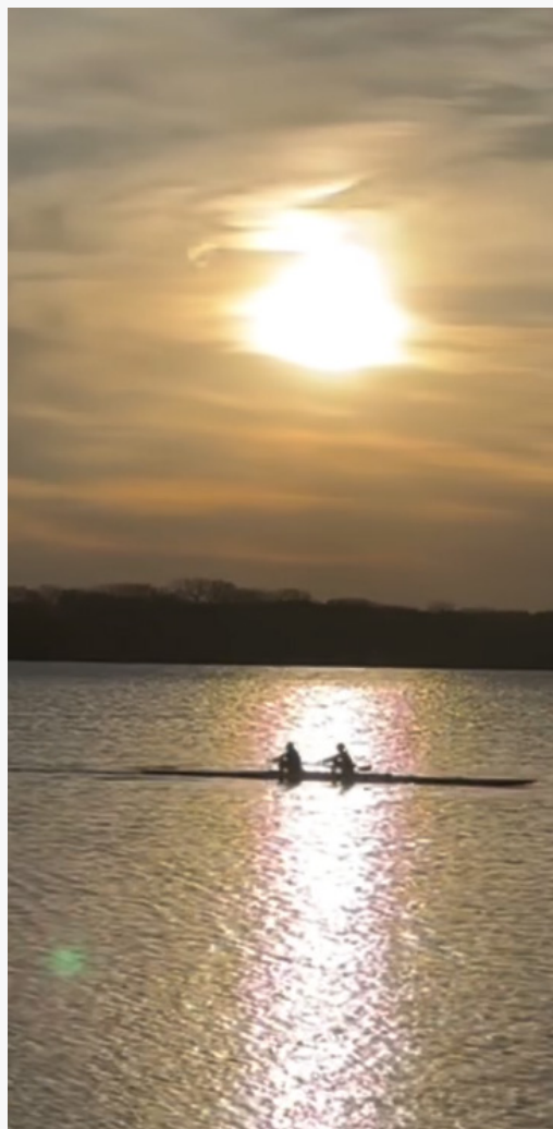
Nebraska Athletes at practice in Equipment provided by FONR