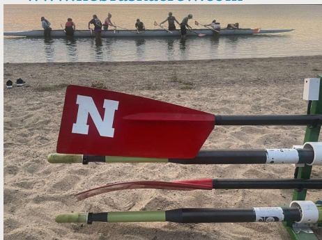
Wet-Docking on the Beach, Oars freshly painted in coordination with FONR

View Updates on our website: www.nebraskacrew.com