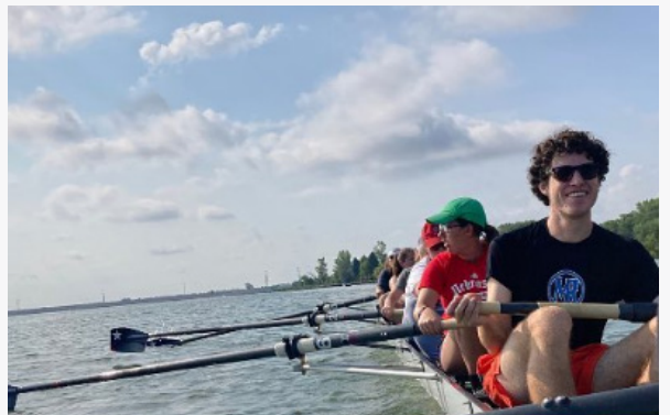
Mixed 8+ Crusin on the lake.