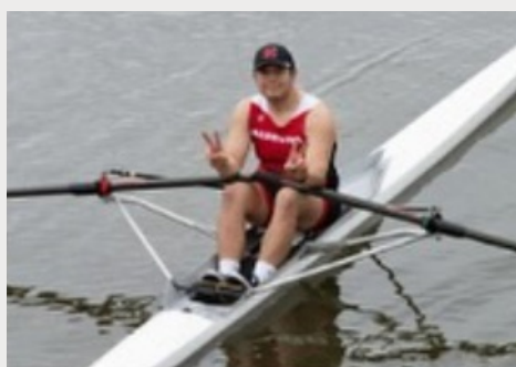
"Peace out" from the Bridges of Wichita